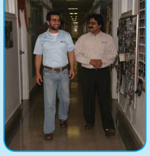
Logistics Plus has relied on a diverse and expert team of employees to get freight where it needs to go — 24 hours a day, seven days a week.

billion in the United States and $3.43 trillion across the globe. The company, which employs about 130 people worldwide and serves such varied customers as GE, Ameridrives, Lord, Railpower, ERS, Riley Power, Sterling Technologies, Snow Dragon, Erie Cotton, ISM, Paragon, Indeck Keystone, TM Industries, Formtech, The Exercise Store and Arvite Technologies, has recently expanded its contracted customer base to Indiana, South Carolina and eastern Pennsylvania. The development has enabled the company to create a buzz and build its corporate identity, while planning for its newest expansion – the acquisition of another logistics firm.