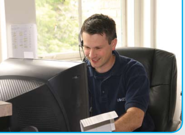
At Logistics Plus, each employee is also a manager, overseeing every detail of a shipment from sales, operations to customer service.

so that employees can eat and enjoy the outside during mealtimes. An onsite fitness center, which helps promote the company's health and wellness program, is also available to employees to use day or night. Additionally, a farmer's market, developed by the City of Erie and sponsored by Logistics Plus, is held in nearby Griswold Park during the summer months. Berlin even has plans to post a legion of 50 flags along Union Station's parapet, showcasing all the countries where it does business and showing everyone that Erie businesses can be intimately connected to the global economy.