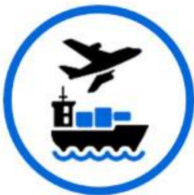
IMPORTING & EXPORTING

To learn more about our Amazon Seller solutions, please visit us online at www.logisticsplus.com/Amazon or send an email to our Amazon retailer and seller support team at amazonretailer@logisticsplus.com .