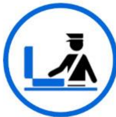
TAXES & TRADE COMPLIANCE