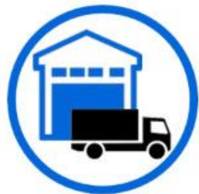
WAREHOUSING & FULFILLMENT