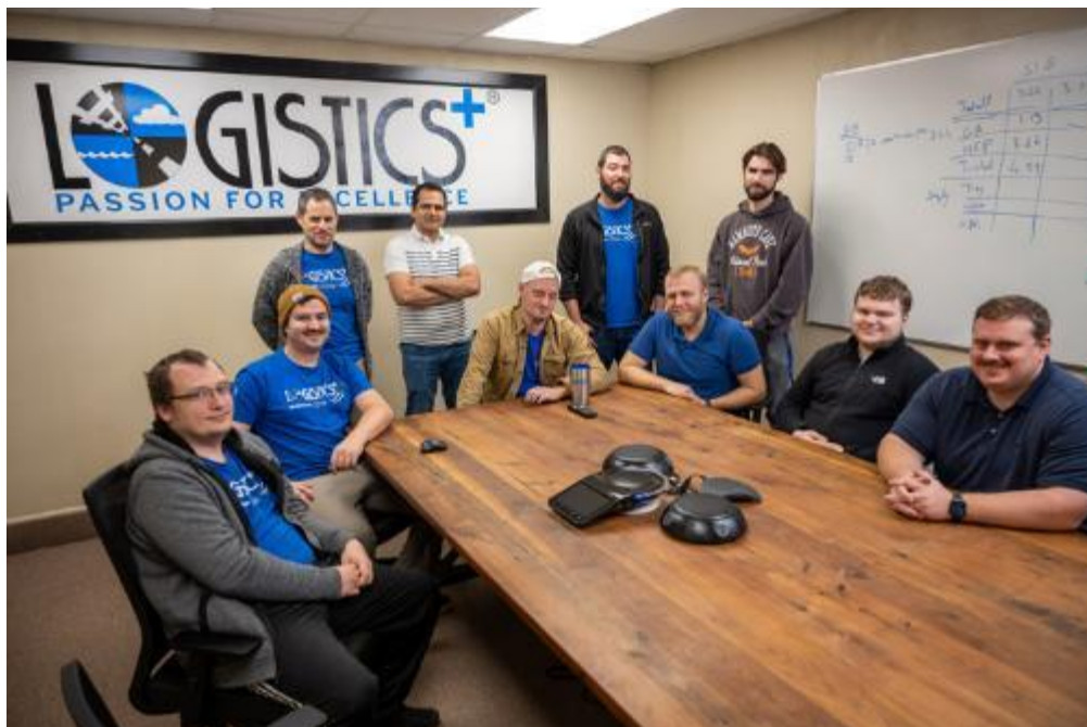
Some of the award-winning Logistics Plus Application Development & Engineering Team assemble for a meeting in Erie, PA.